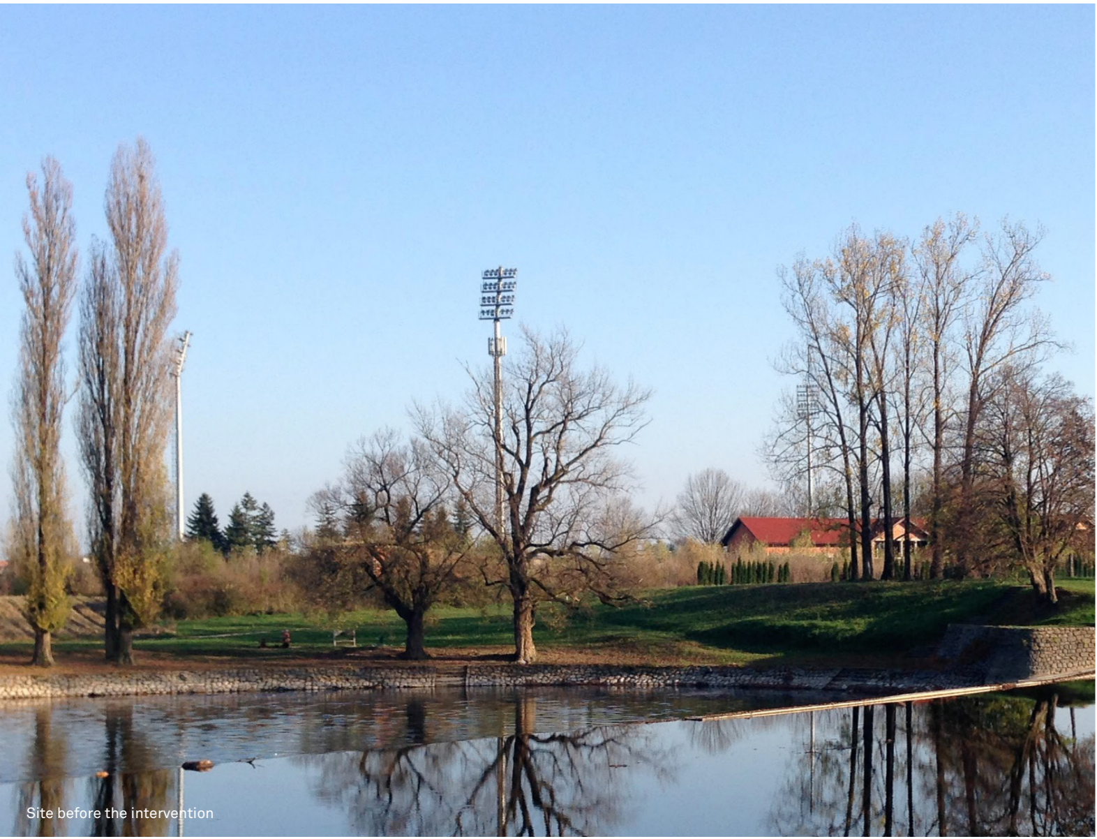
Site before the intervention

three pedestrian routes three parts of the building forming a square buildings covered with greenery act as a part of the landscape