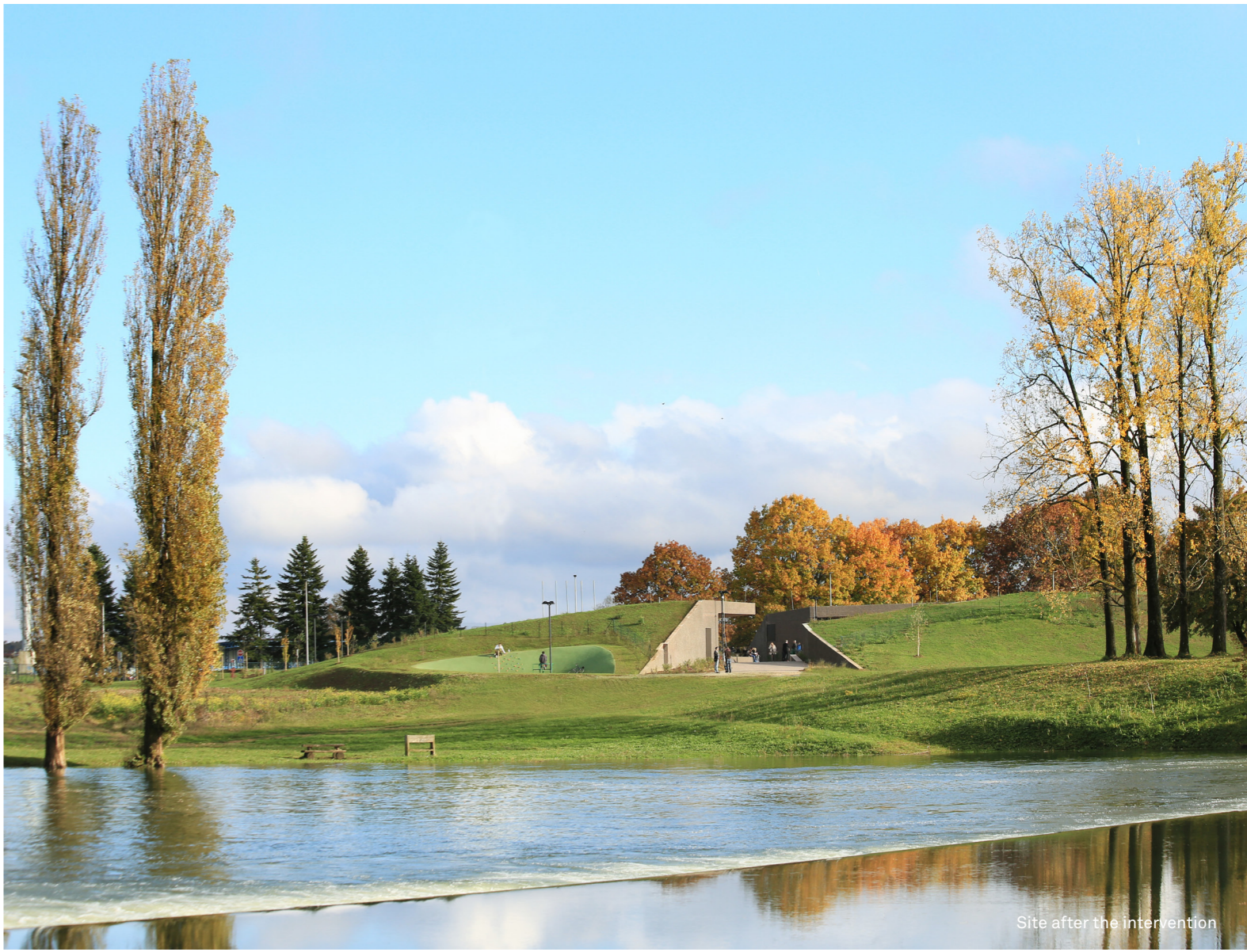
Site after the intervention