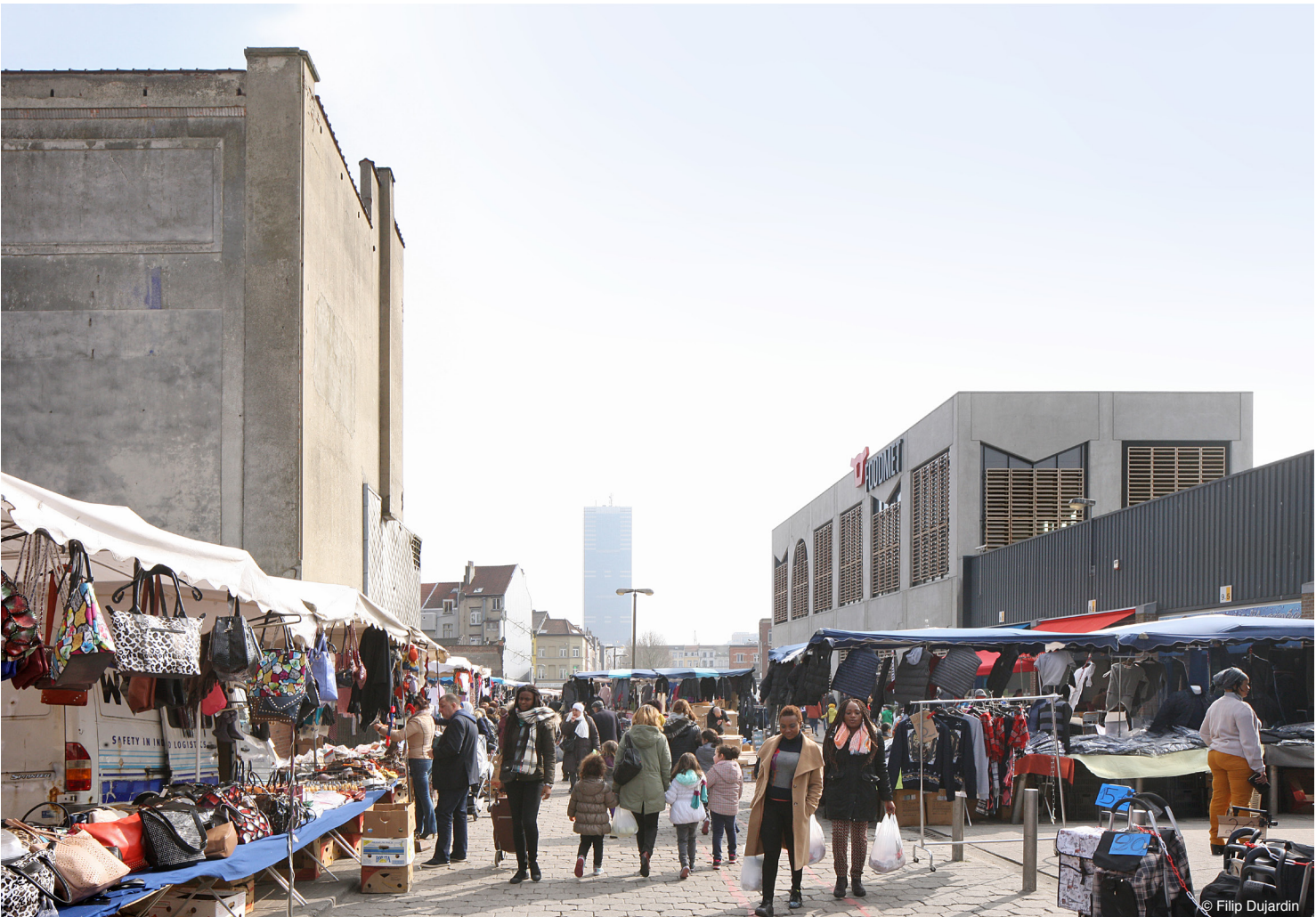
Pedestrian corridor between metro stops, looking southeast (north-west facade)