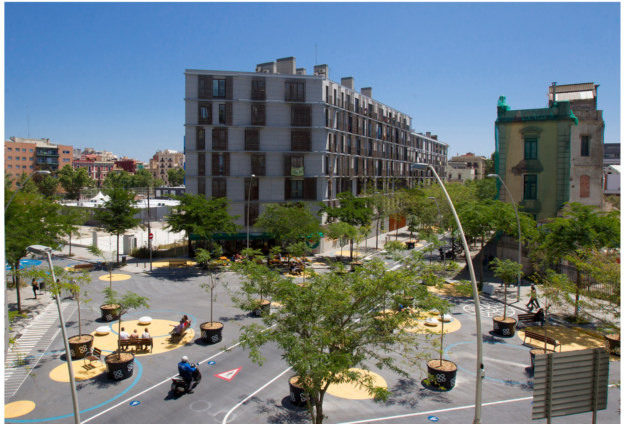
Crossroad Sancho d'Àvila and Roc Boronat