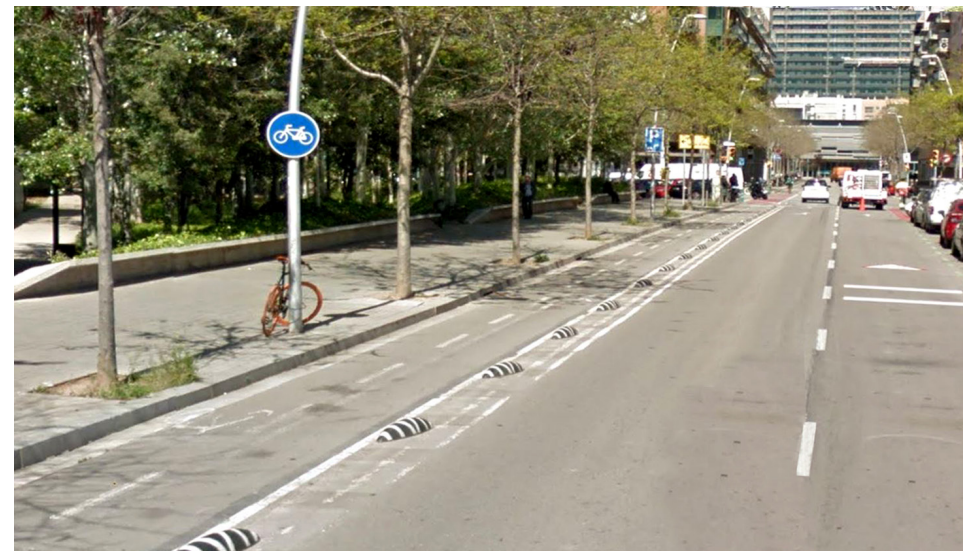
BEFORE: Sancho d'Àvila Street