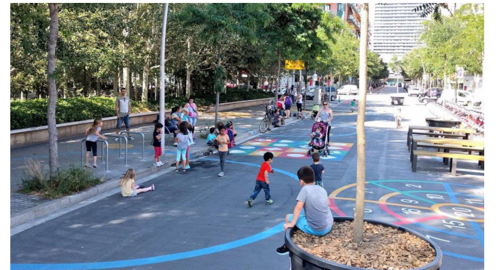
AFTER: Sancho d'Àvila Street