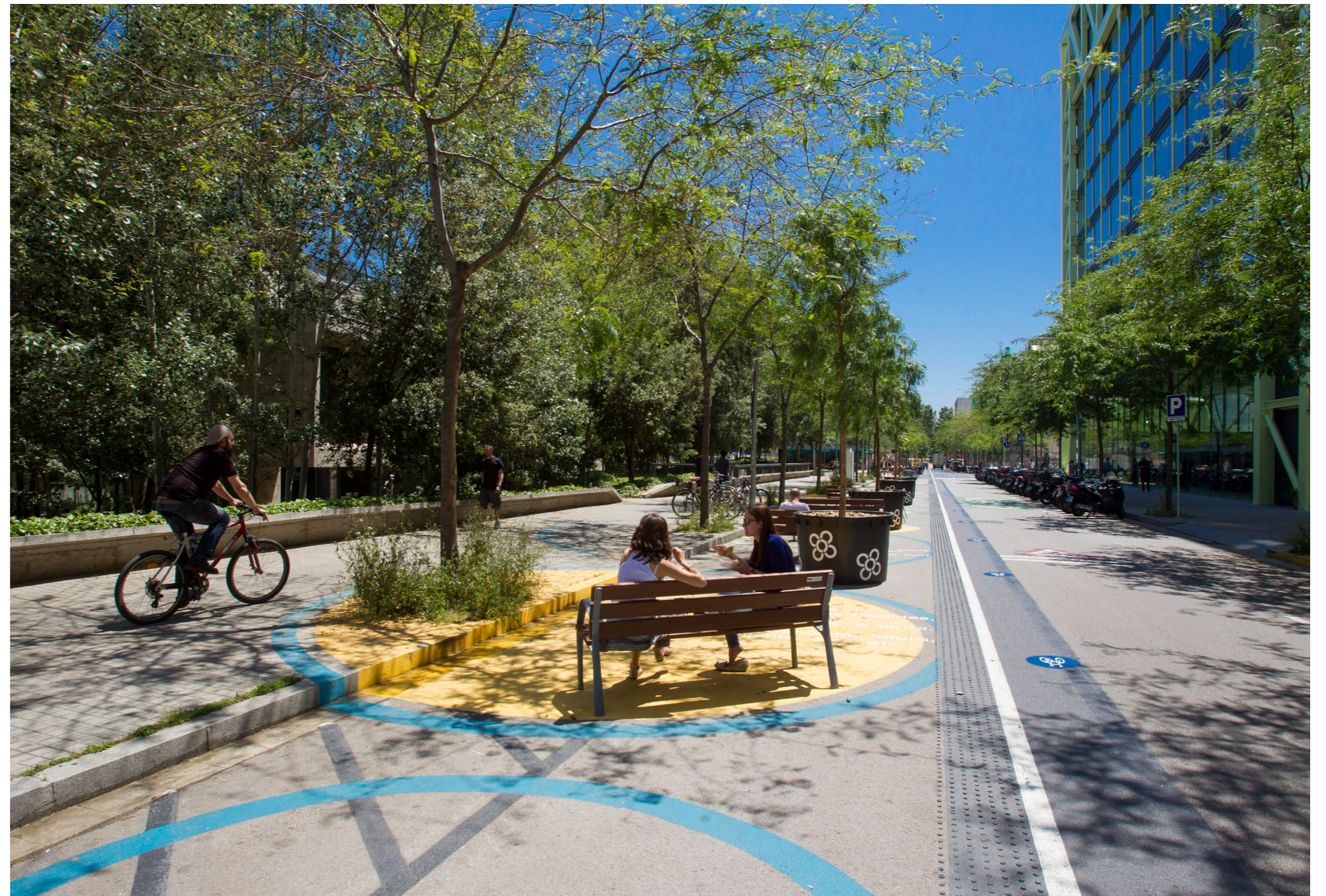
Roc Boronat Street