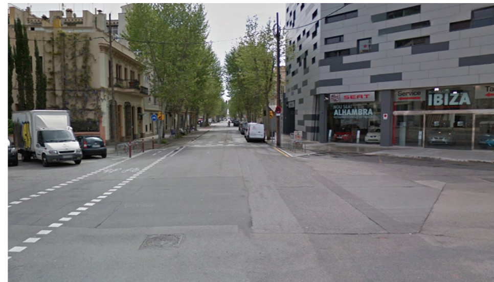
BEFORE: Crossroad Almogàvers and Ciutat de Granada