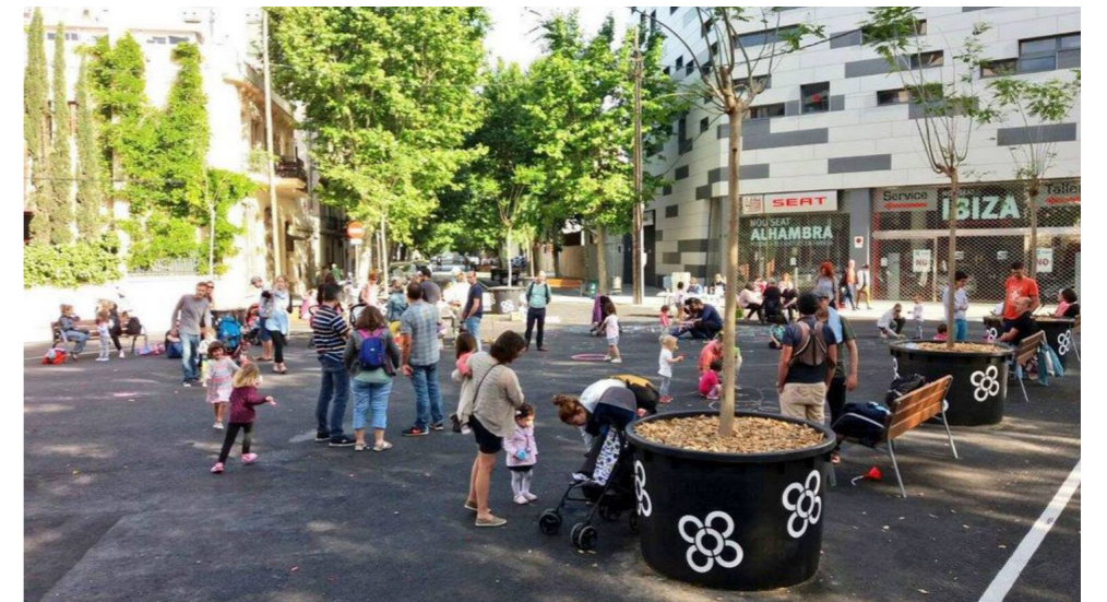
AFTER: Crossroad Almogàvers and Ciutat de Granada