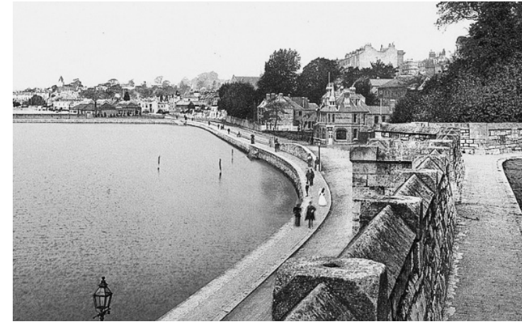
view north along town wall 1820