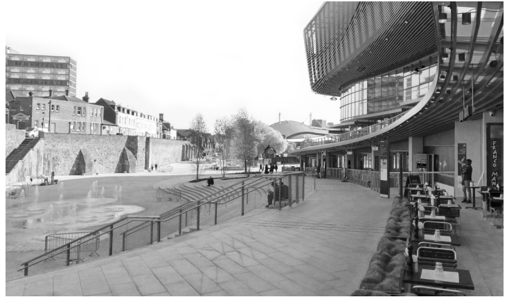
View south along town wall 2017