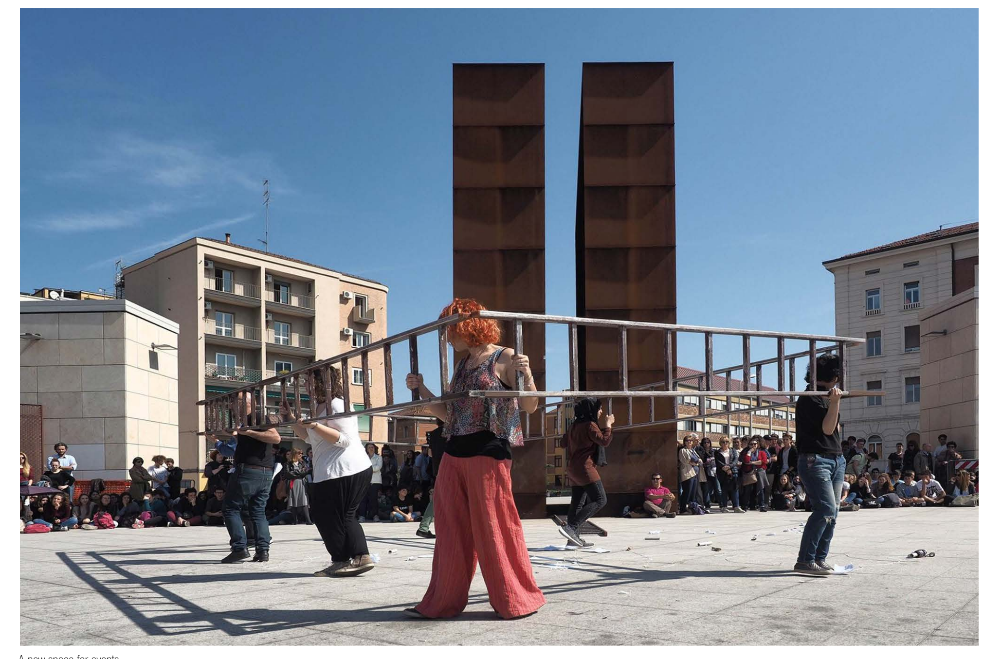
A new space for events

SET ARCHITECTS - BOLOGNA SHOAH MEMORIAL KOO5