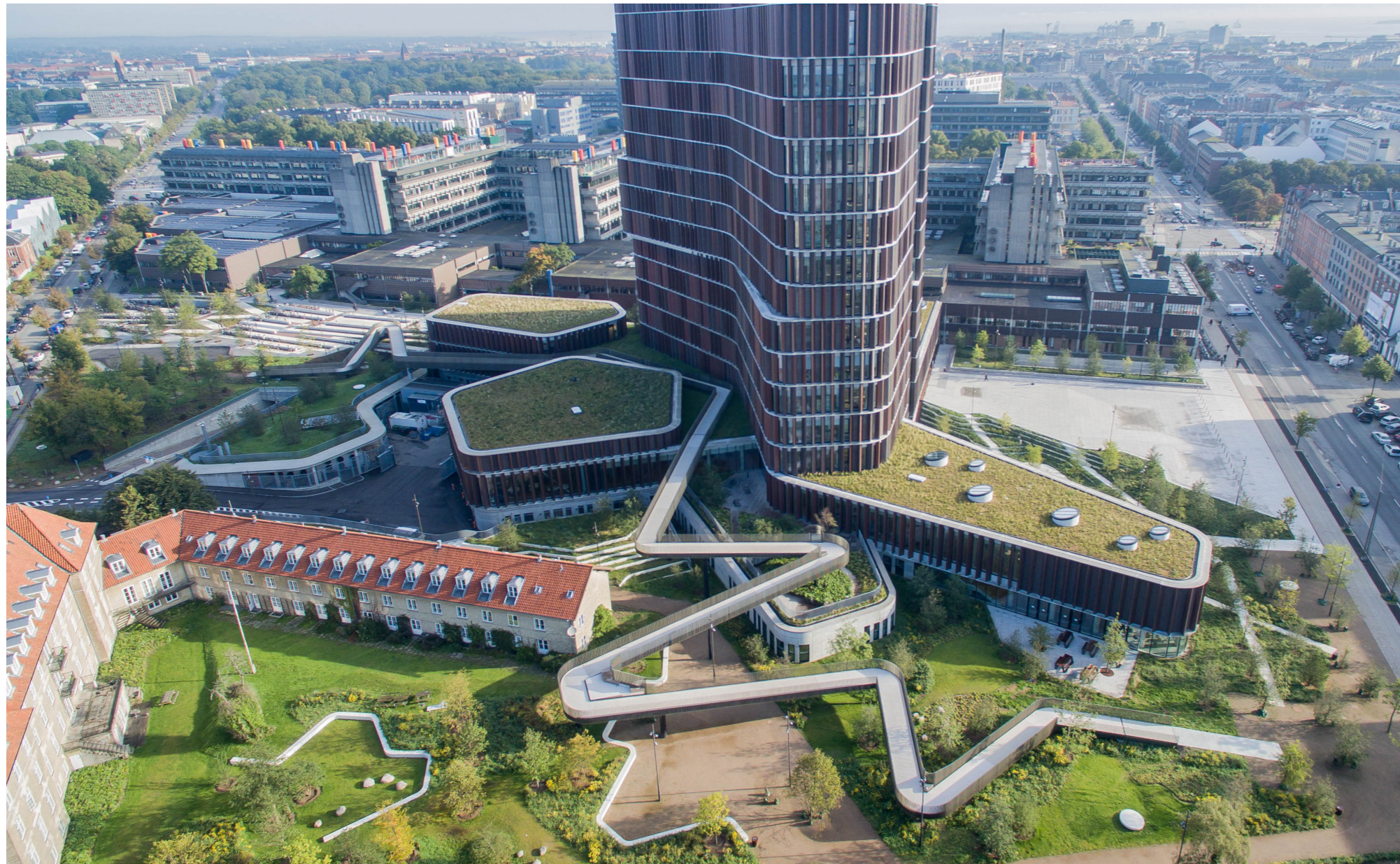
SUND Nature Park is a modern campus park that optimises a good research and student's life while adding a green, social and ecological heart to the Nørrebro neighbourhood.

Facts, SUND Nature Park: LANDSCAPE ARCHITECT/ SLA CLIENT / Danish Building and Property Agency and University of Copenhagen SUND AREA / 37,000 m 2 COLLABORATORS / C.F. Møller, Rambøll, Aggebo & Henriksen, Skælskør Anlægsgartnere, Byggros, Birkholm Planteskole