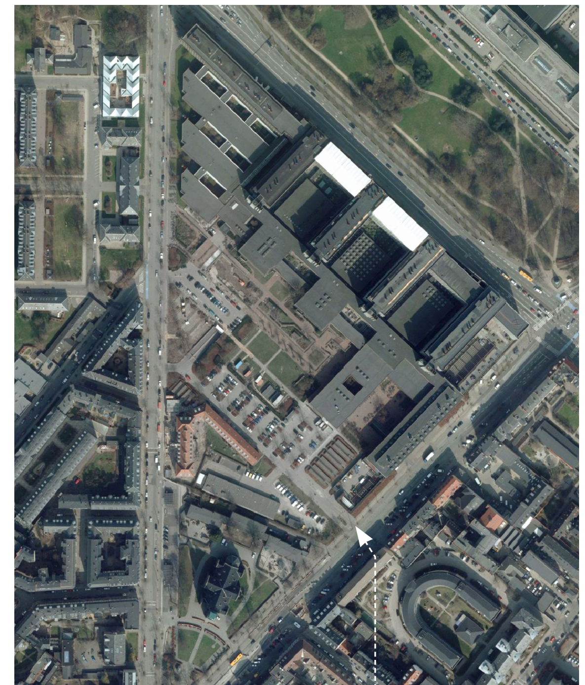
The previous site was inaccessible, grey and dominated by cars and parking lots. Due to its vast size the complex created a gap in the neighbourhood.