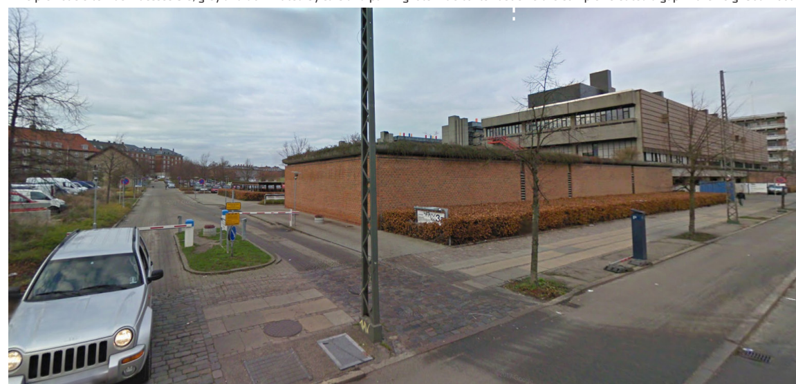
The campus area was bordered by walls, fences and bars. The recreative qualities were few and only directed towards the students and researchers.