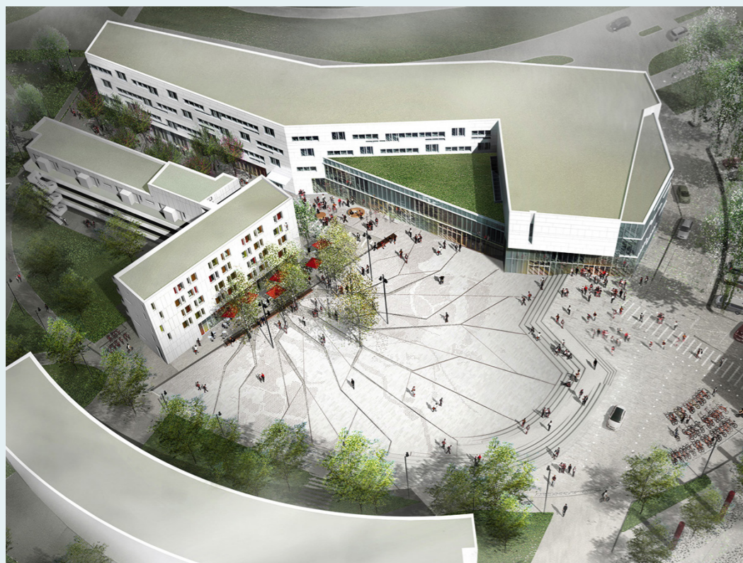
Örebro Campus Square, Sweden

“There's a greater understanding of architecture's role in the society we live in. Before, people saw a building or an urban square as an isolated object with no context.