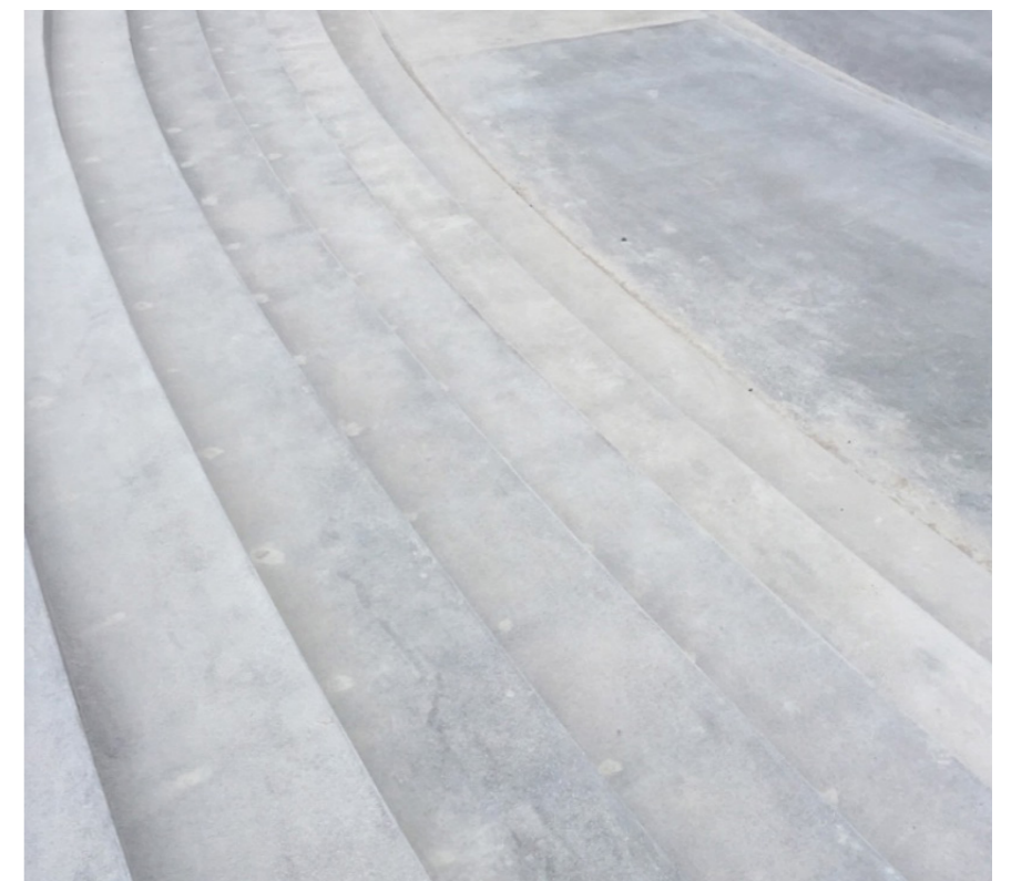
2600 m2 February 2018