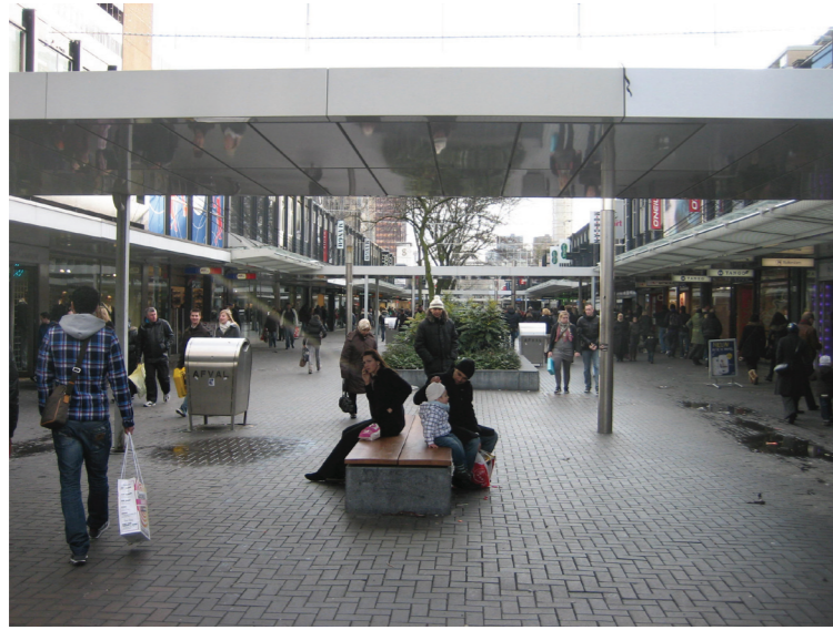
situation Lijnbaan before intervention: streetfurniture is blocking the perspective on the architecture