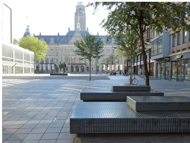
new situation Stadhuisplein