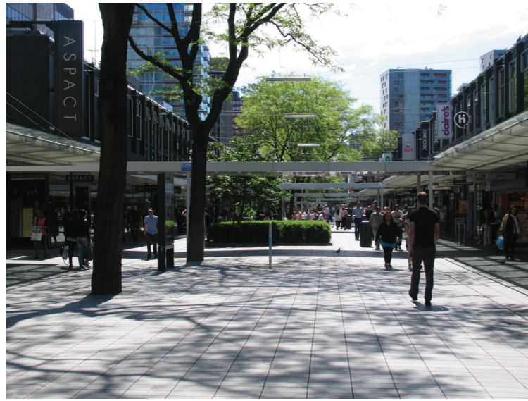
new situation Lijnbaan