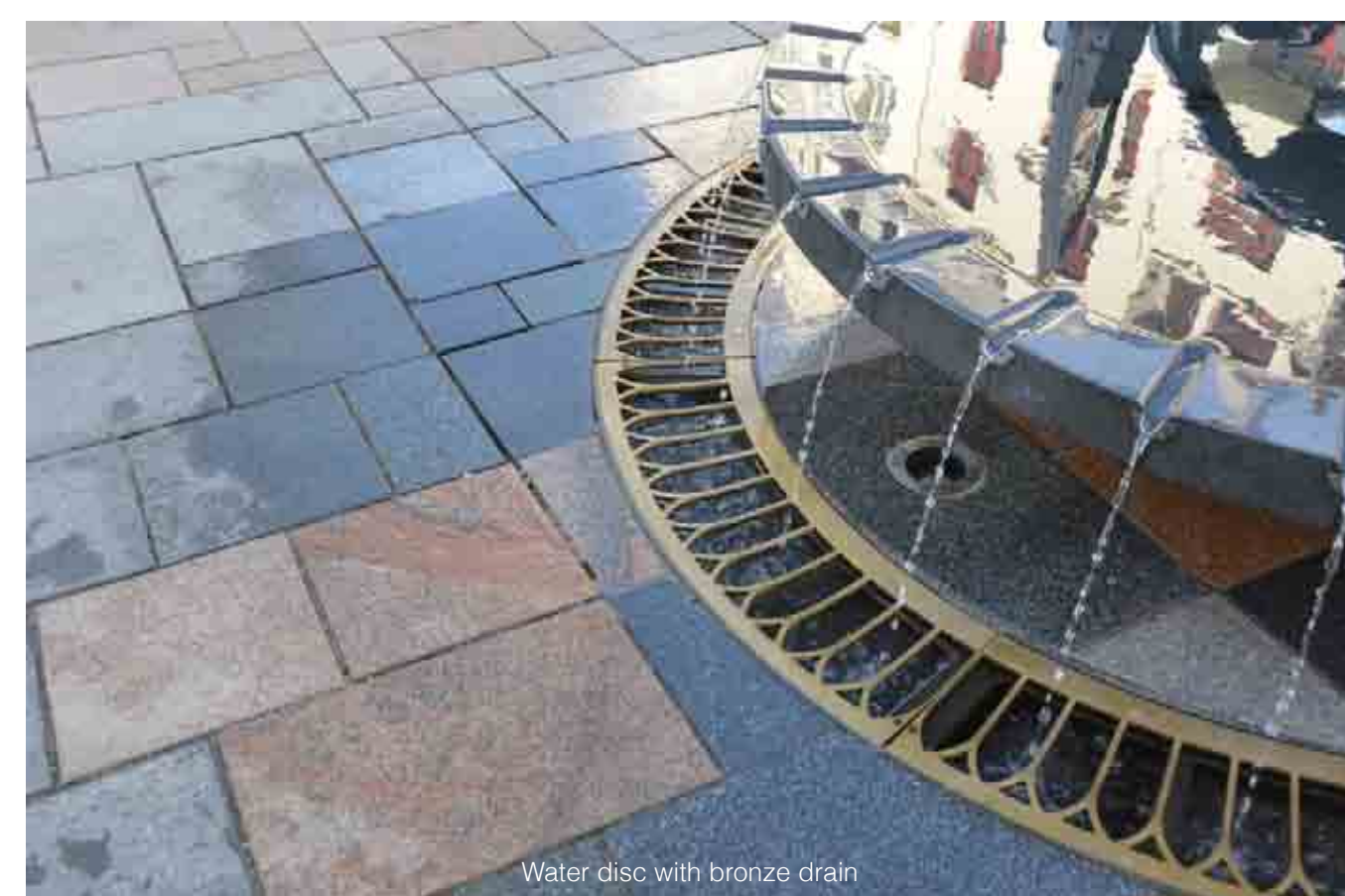
Water disc with bronze drain