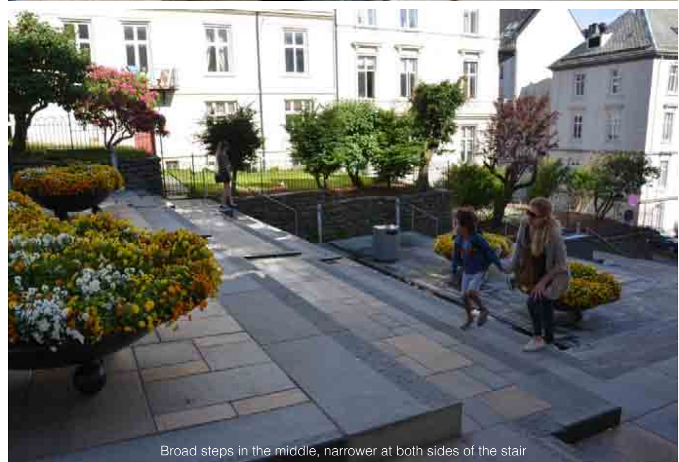
Broad steps in the middle, narrower at both sides of the stair

Landscape architect / Lighting designer: landskap DESIGN AS Landscape architect / professor Arne Sælen In cooperation with In'By AS : Landscape architects Ola Bettum, Peer Lehn-Pedersen