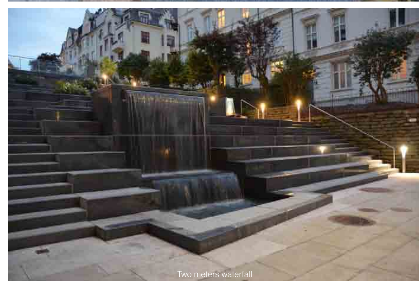
Two meters waterfall