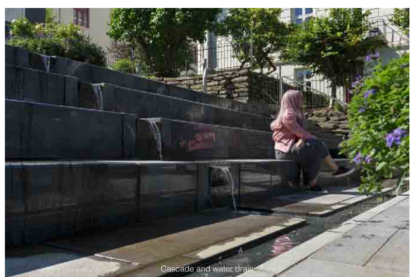
Cascade and water drain