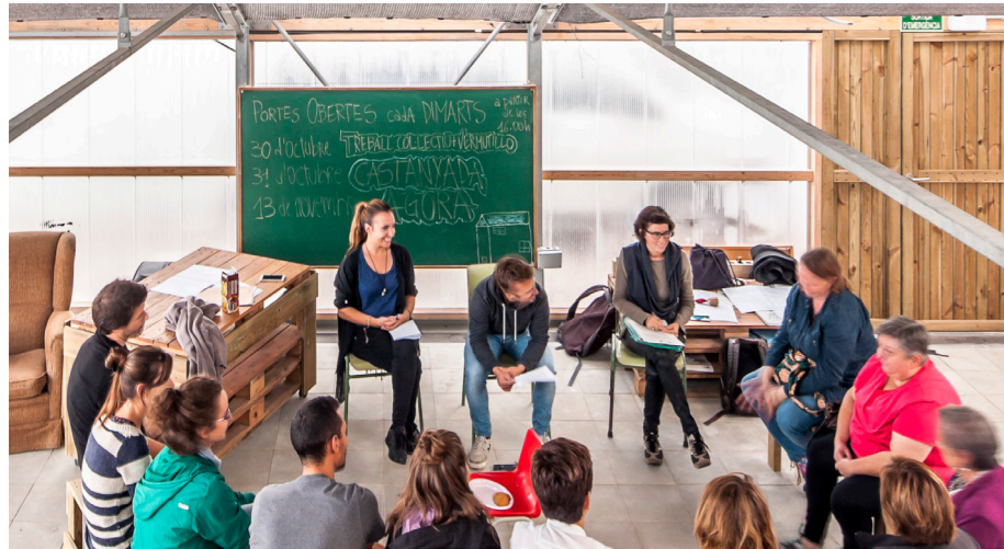
ESPAI (E)CO_NEW EQUIPMENT & NEW ENTITY