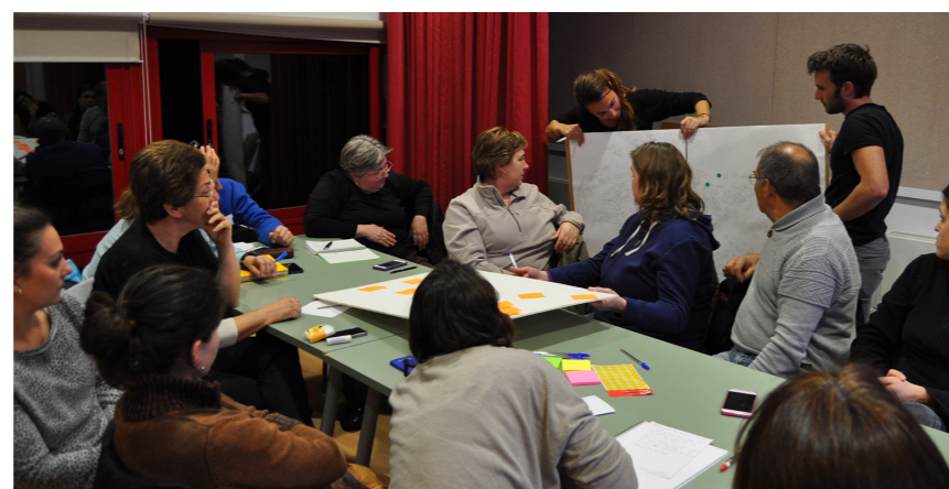
ENTITIES OF THE NEIGHBORHOOD