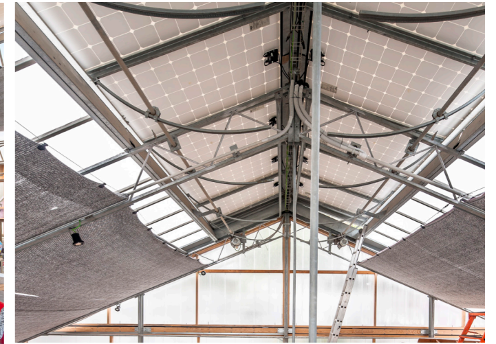
SOLAR & SOCIAL ENERGY