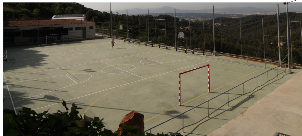
PERE GRAU AREA_VIEW 1

The proposal aims to reinforce the character of the neighbourhood associations putting in value the neighbourhood claims to equip and recover this space unused because it is able to accommodate and promote popular events, inspiring everyday social relations.