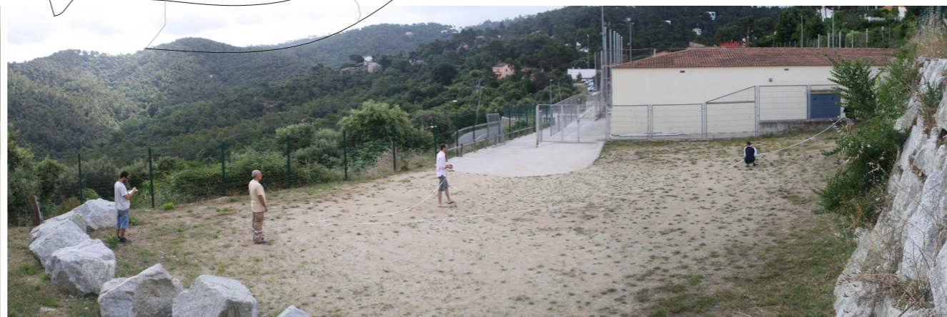
PERE GRAU AREA_VIEW 2