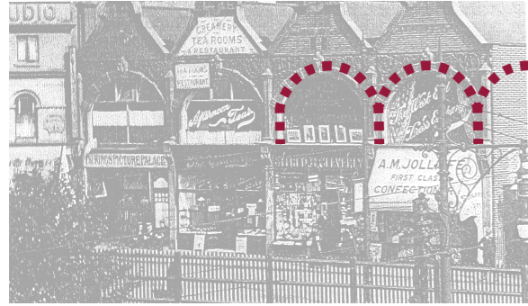
The project extends the extraordinary historic and contemporary identity of the place. Key assets include the Picture Hall, Croydon's first cinema, May 1908 - 1917.