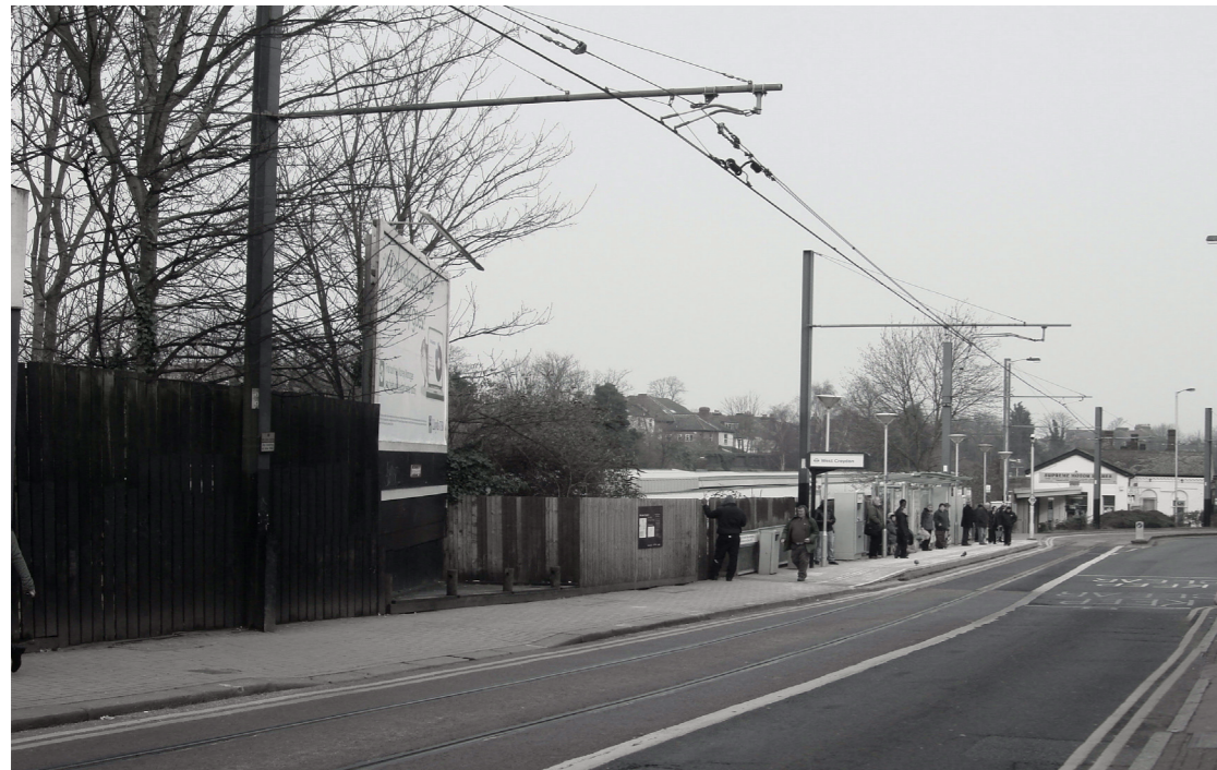
Engaging with the edges: A new interchange route linking station entrances to the High Street and Circus was enhanced by a new planted mesh fence designed to give a clear spatial definition and identity to this edge of West Croydon. (Before and after)