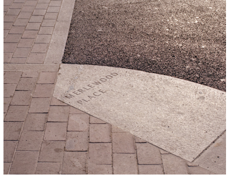
Placemaking in detail: names of famous people local to Eltham are engraved on street benches; special terrazzo mat to the entrance of the 1930's Eltham Arcade; granite quadrants naming the unique alleyways perpendicular to the High Street.