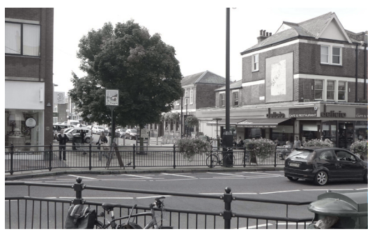
Key high visibility moments within the High Street relate to the history and identity of the place. A new large striped crossing at Passey Place, connecting both sides of the street whilst slowing car speeds. The large Portland stone Eltham sign makes a public space between the 19th century lychgate and tramsheds.