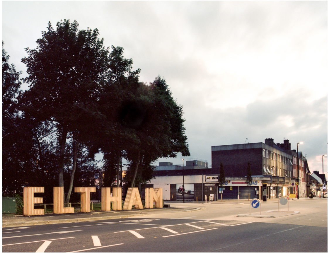
Alongside new tree planting, a large timber sign naming Eltham that is visible from the road and footway aimed to create a special moment that evokes the character of the street changing from town to countryside.