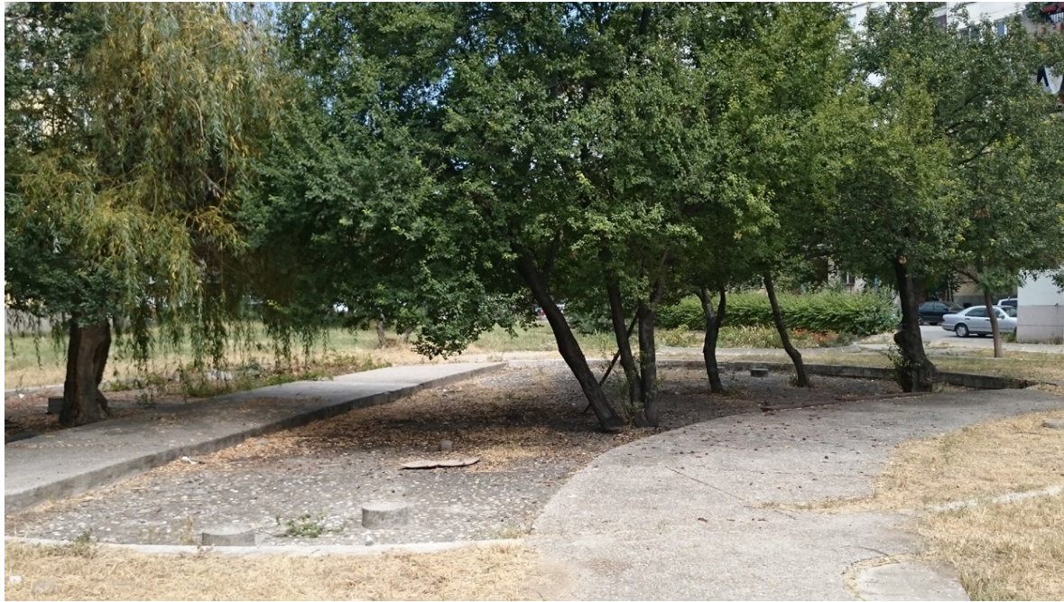
the area before, photo: ONE ARCHITECTURE WEEK