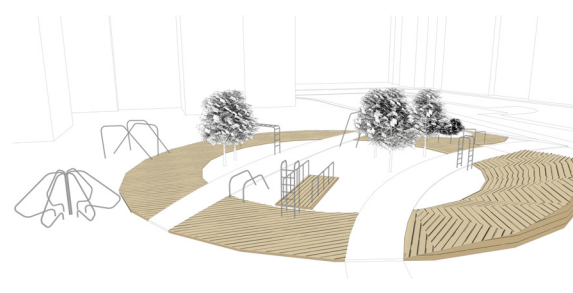
visualisation of a vision

ONE ARCHITECTURE WEEK 10 — 19.10.2014 PLOVDIV