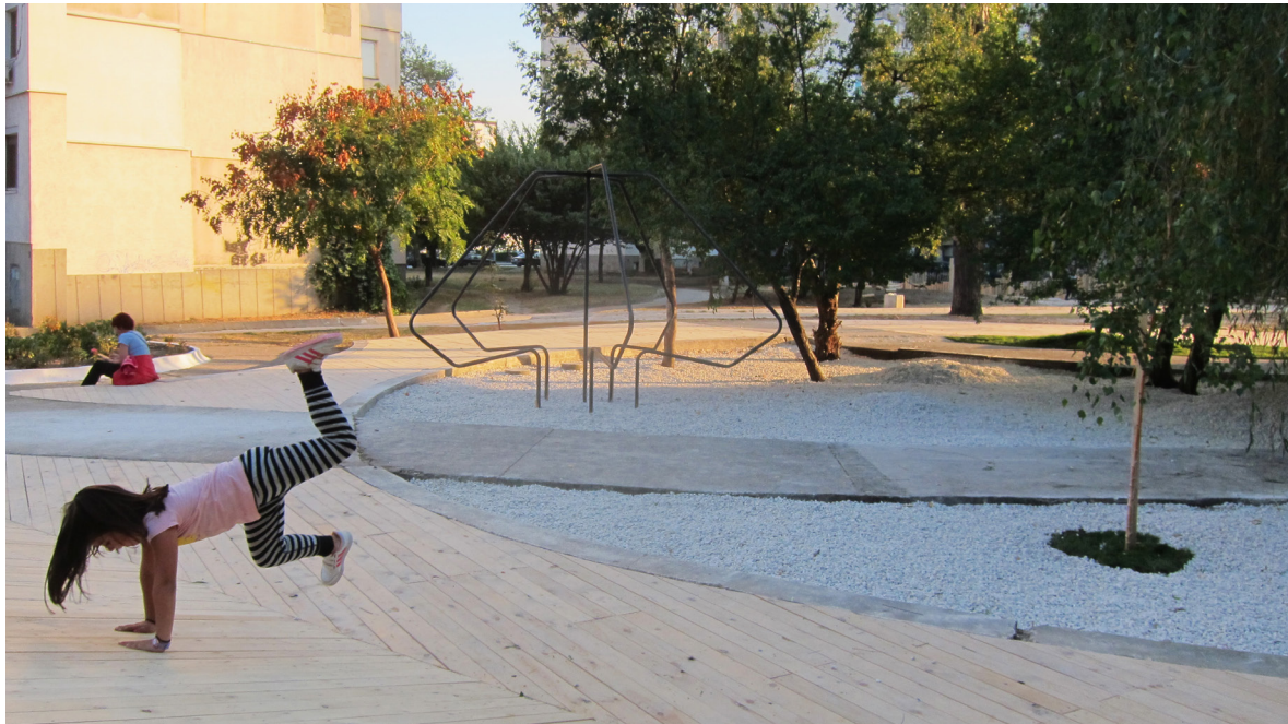
... and after

The district of Trakiya was designed in the 1970's to become an exemplary Plattenbau district; it is now the largest in Plovdiv. In-between blocks 1, 2 and 3 of the post-war panel flat housing estates of Trakiya we found this abandoned outdoor swimming pool. A place at once generic and specific, the pool is present through its physical traces only, having been dry for nearly the entire time of its existence. All pool-appliances have been removed, and the basin is filled with concrete. A large amount of the estate's state-built apartments were privatized right from the beginning; today all apartments are private property. While private initiatives to customize these apartments took off especially after the fall of communism, hardly any work was ever done on the communal pool structure.