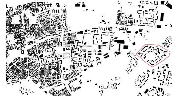
Trakiya in Plovdiv (BG)