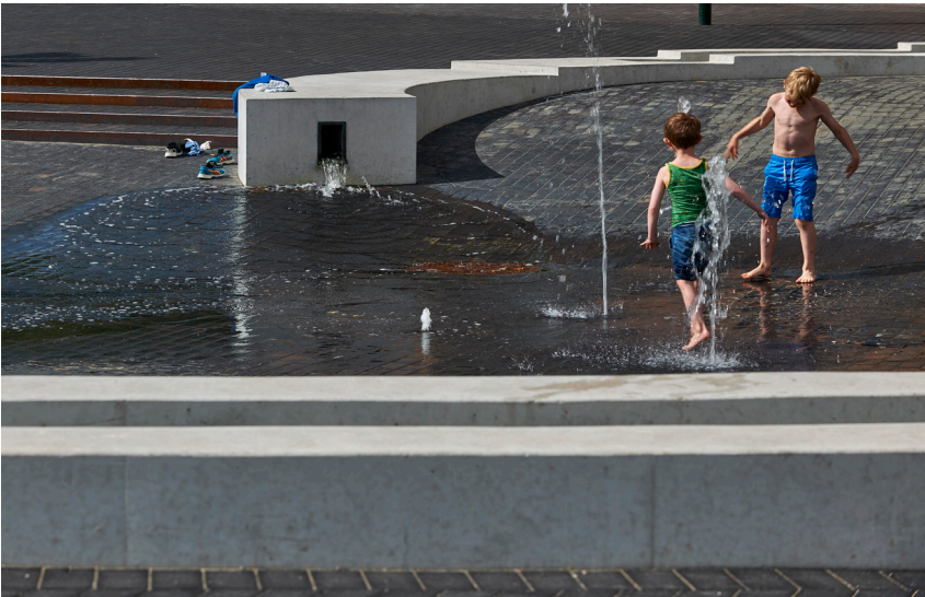
The square is a combined storm water and activity area