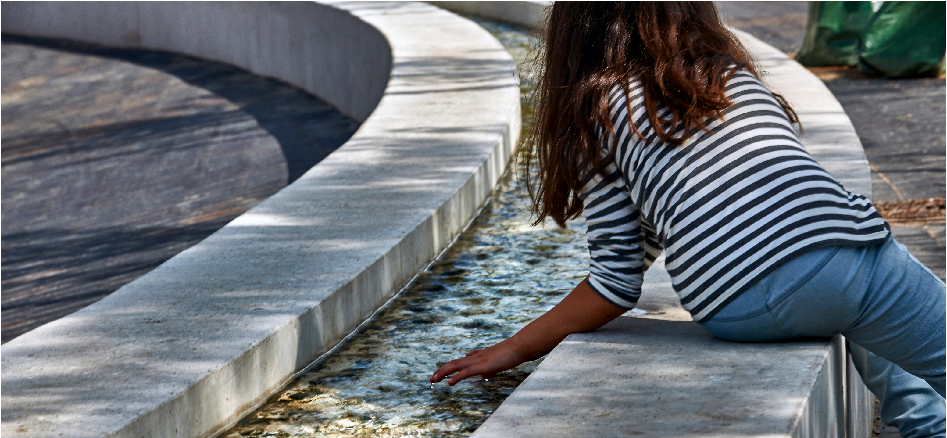
An urban square named Sløjfen absorbs rainwater from the roads alongside the park and receive the water that is not directed into the park. Rainwater is collected, cleaned in the underground pipes and led in a grand movement based on Fibonacci's spiral geometry