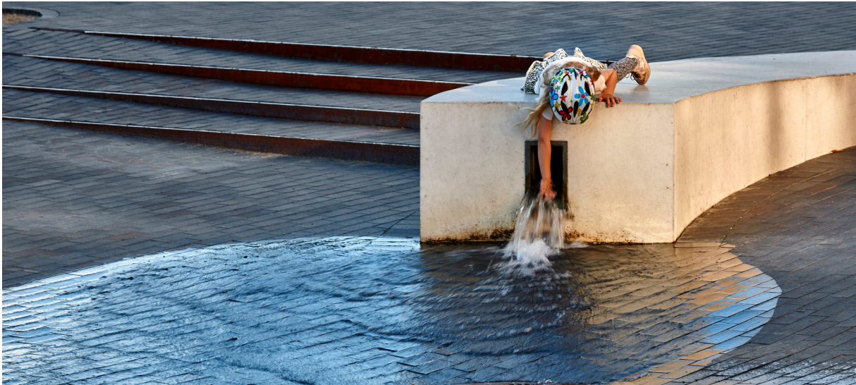
Cleaned rainwater is pumped up in Sløjfen