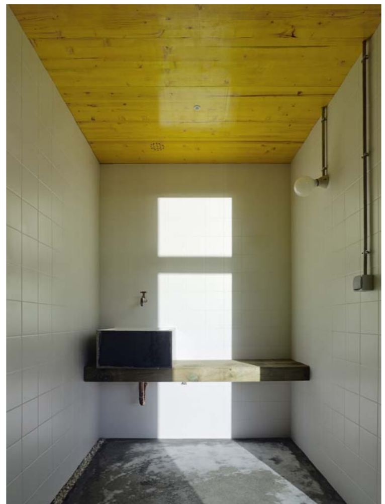
_office detail view