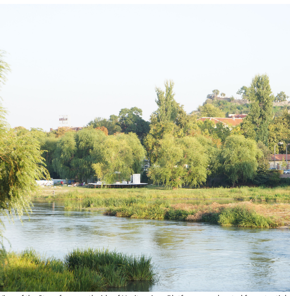
View of the Stage from north side of Maritsa river. Platform was elevated for potential flooding, 2015.