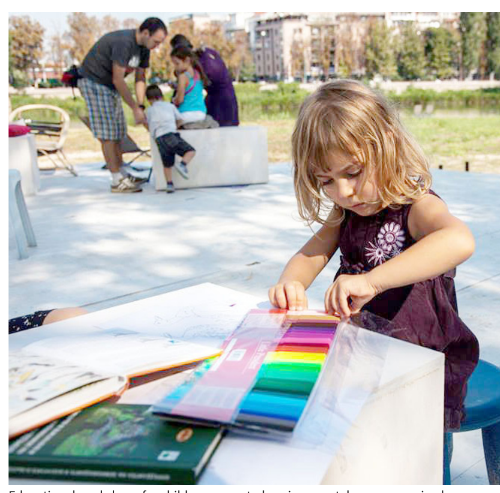
Educational workshops for children promoted environmental awareness via play. Modular boxes are transformed into tables. 2015.