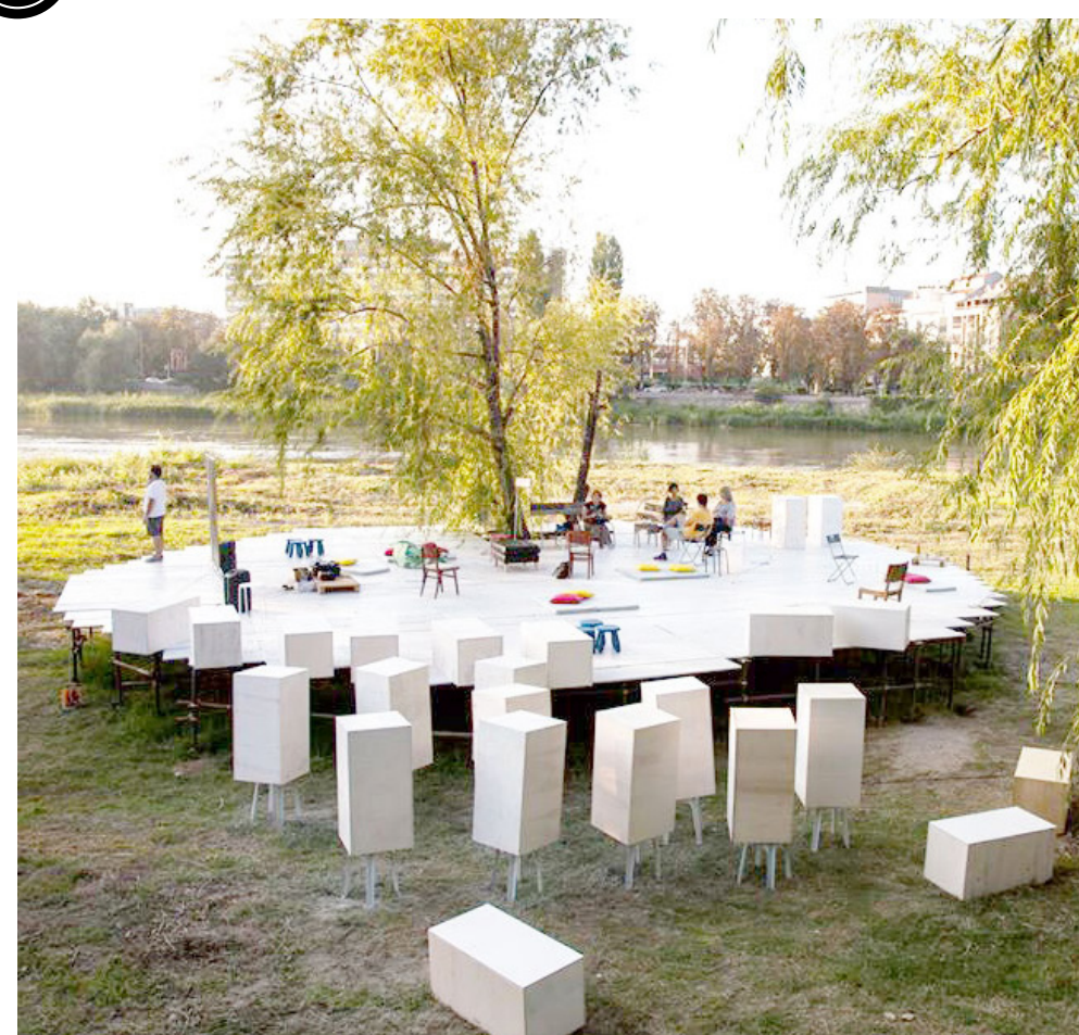
Informal gatherings of citizens took place at the Stage throughout September, 2015.