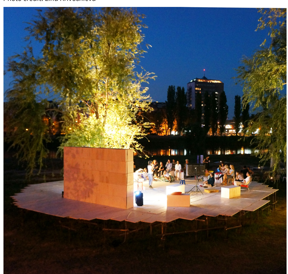
Evening lectures and debates required flexible configuration of furnitures, including the projector screen of stacked modular boxes, 2015.