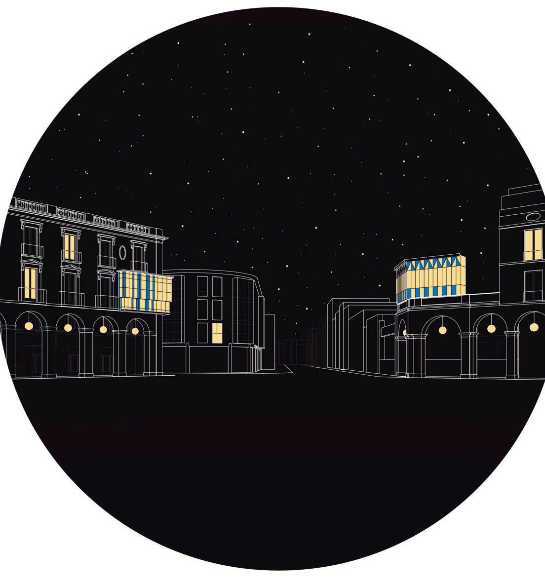
Two Corner Bay Windows / Dues tribunes a la cantonada